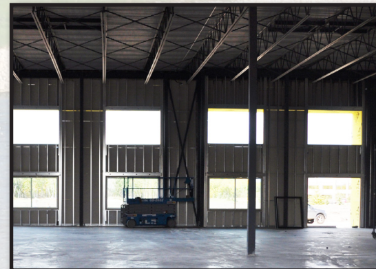
Base Building Interior