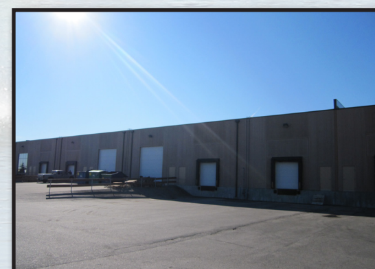
Loading Area with Doors