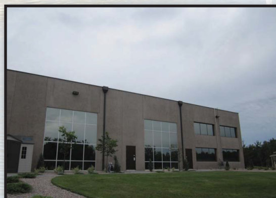
Loading with Glass Panels